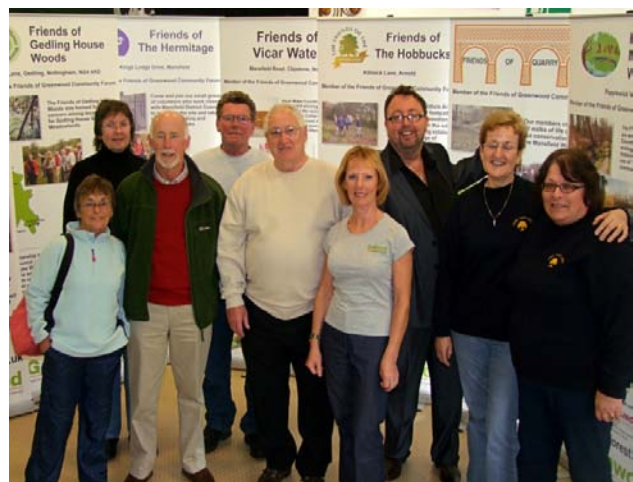
Friends with their new banners