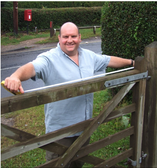
Measuring up for access audits

It is important that green space sites are as far as possible, accessible to all. Unfortunately, a number of barriers can prevent individuals from making use of a site, ranging from physical barriers associated with choices in countryside furniture, to issues around the provision of information both on and off-site.