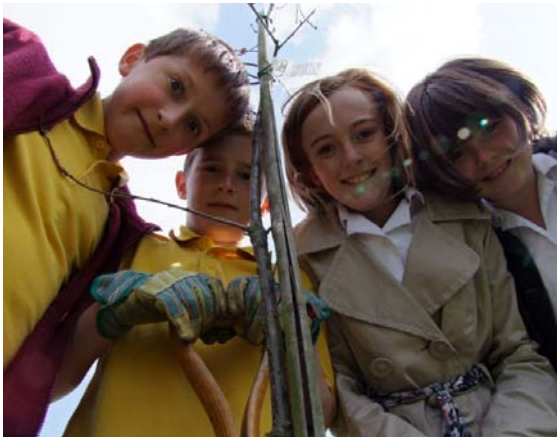
King Edward's School tree planting

Greenwood's Community Tree Planting Grant (GCTPG) scheme was established in 2000 and has since provided grants totalling £44, 850 for over 150 projects across the Greenwood area. We've helped nearly 6,000 adults and children to plant over 15,000 trees, many on school grounds.