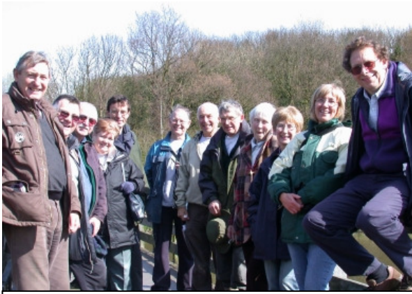
The Forum visits Rufford

In April 2008, the Forum met at Rufford Country Park , bringing together 33 people from 19 Friends groups. This meeting helped the Biodiversity Action Group to recruit volunteers to help at the upcoming “Bioblitz” event, and included a walk and talk on the history and future developments of the park.