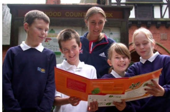
Physical Educational Pack launched at Bestwood