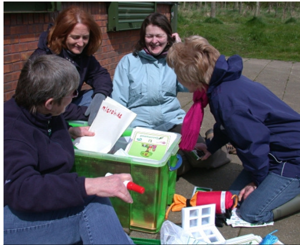
Teachers try out Lesson In A Box

Boundary & Tippings Wood is one of the sites to have benefited from a LIAB resource pack.