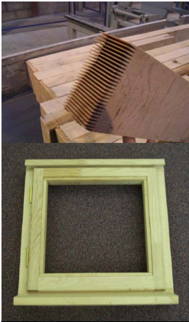
Green gluing: finger jointing and finished frame