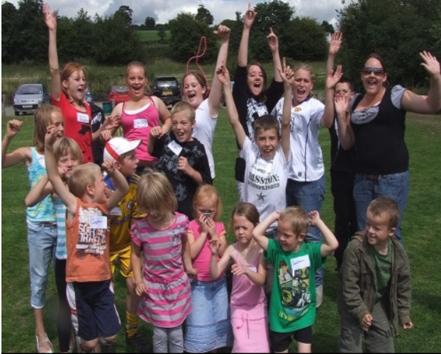
Mayfield Summer Slam!

A number of Greenwood's events support activities delivered by other parts of Nottinghamshire County Council. In 2009, we spent five days working with four teenage girls, helping them to organise the " Mayfield Summer Slam ", a family fun day on their local recreation ground in Kirkby in Ashfield. We linked to Notts County Council's youth workers as well as to officers from Ashfield District Council. We passed on skills relating to consultation and advised on the type of activities that were safe and feasible. The day itself included environmental workshops provided by the Greenwood team, as well as sports and physical activities.