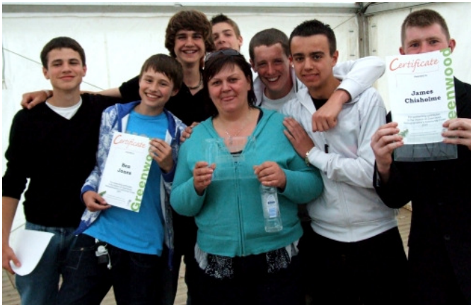
Arnot Hill School Award Winners