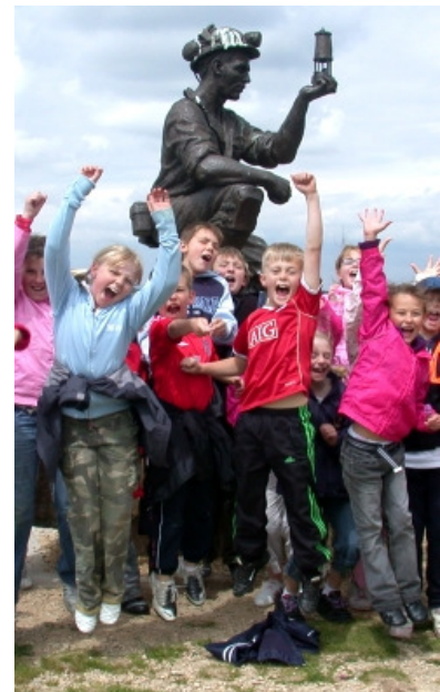
Getting excited about the Teversal Trail

Team members also supported NCC officers in running workshops for local children to help in naming the new Ashfield-Bolsover trail network.