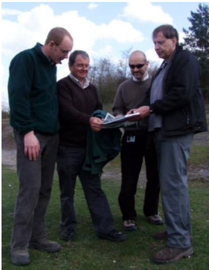
Surveying the Ranges

Greenwood recognises that good conservation management of woodland sites can be restrained by costs. Thanks to funding from the Forestry Commission, we started research work in 2009 to consider the potential for woodland management to earn income from timber sales or by accessing conservation grants.